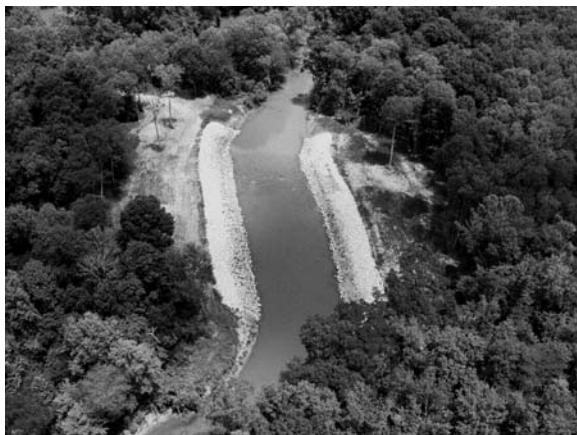
An aerial view of the pathway created by the Wolf River Environmental Restoration Project.

The Wolf River Project has become a critical component of the County's metro-wide sustainability initiative and provides a textbook example of what can be done when imagination and resolve come together for a common purpose. Most of all, it has been successful because of the contribution of a diverse group of stakeholders that included Shelby County Government, Chickasaw Basin