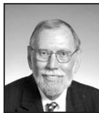
Rep. Bill Harmon

Tennessee's highways have been described as some of the best in the nation; we have been fortunate. The federal stimulus funds we received last year helped tremendously to maintain the roads, but we need to meet the growing need for an improved transportation system. The thing that worries me is that costs continue to go up and revenue seems to have remained flat. How long can we maintain one of the best road systems in the country? We can't predict that.