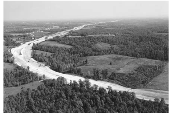
I-40 under construction between Buffalo Valley and Silver Point, Tennessee. The project was completed in 1963.

this year's edition to cover virtually every region of the country. Cost is $49.95 for ACEC members. To order, go to the Bookstore at http://www.acec.org . Then do an advance search for 1-58855-069-9.